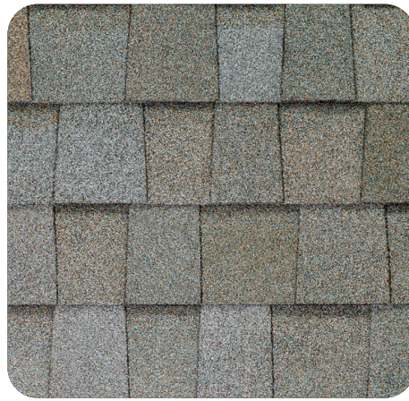
Cool Moonlight Beach