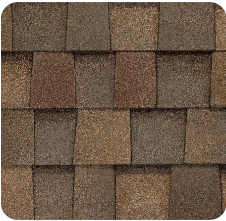
Cool Coral Canyon