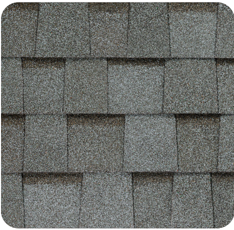
Cool Coastal Cliffs